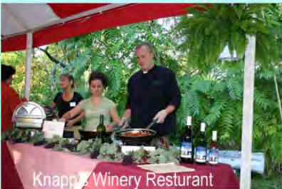
Knapp's Winery Restaurant